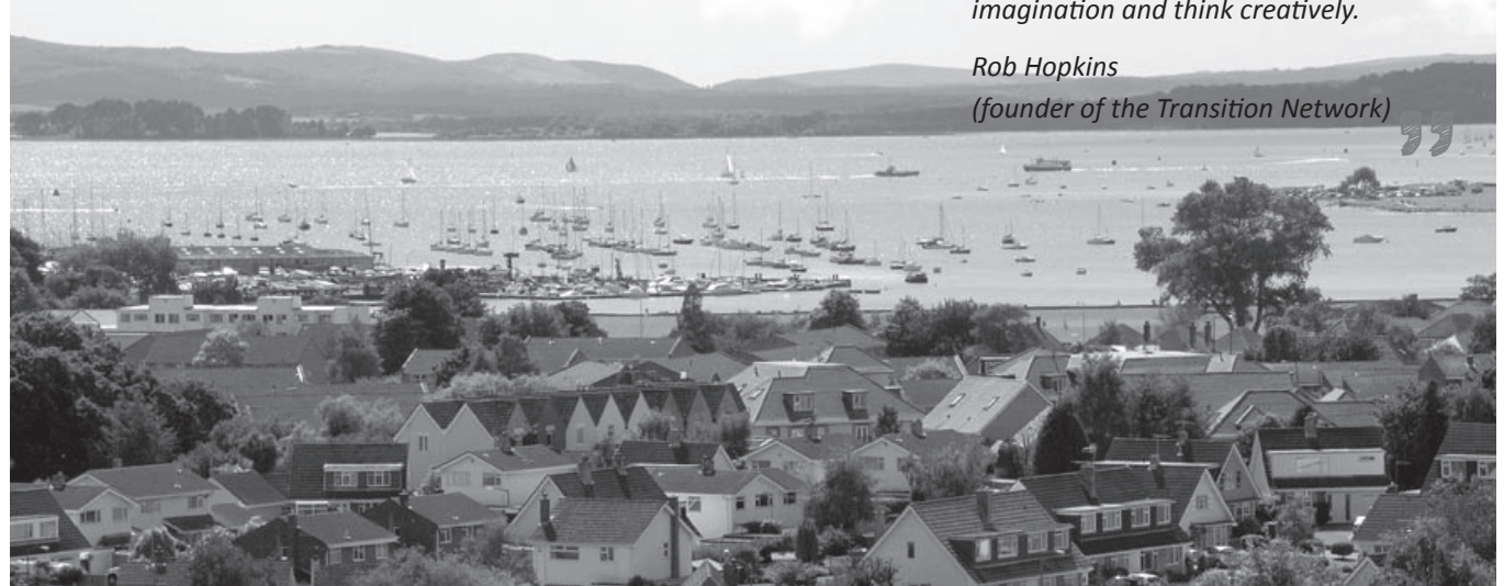
Poole from Seaview